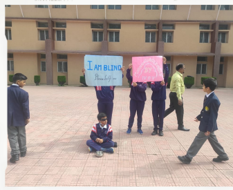
ASSEMBLY BY CLASS 4 AND 5