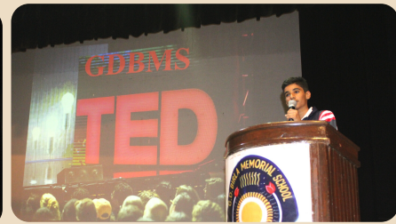
TED TALK AT ASSEMBLY