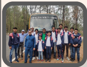
Outing to Almora