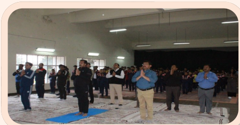
INTERNATIONAL YOGA DAY